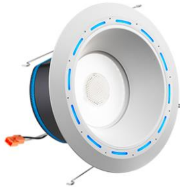
LED Voice Control Speaker Light with Alexa built-in