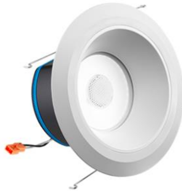
LED Speaker Light